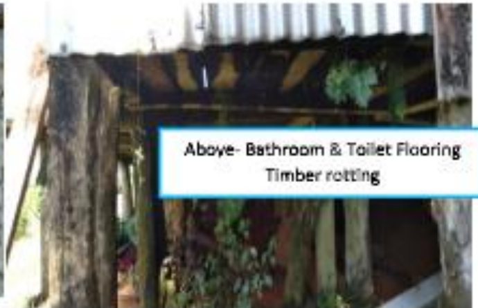
Above- Bathroom & Toilet Flooring Timber rotting