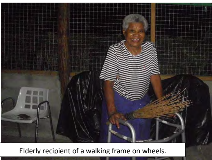
Elderly recipient of a walking frame on wheels.