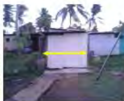
Extend current bathroom to fit wheelchair and caregiver.