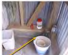
Flooring cemented and laid one layer of block.