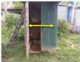
After Construction Photo: