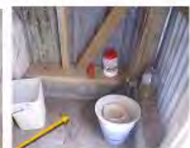
Flooring – fill-in concrete cement