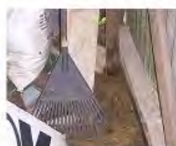
After Construction Photo: