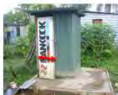
After Construction Photo: