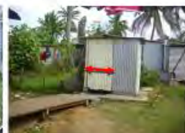
Door – Widen door to fit width of the wheelchair